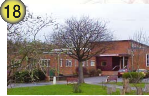
Highbury Primary School