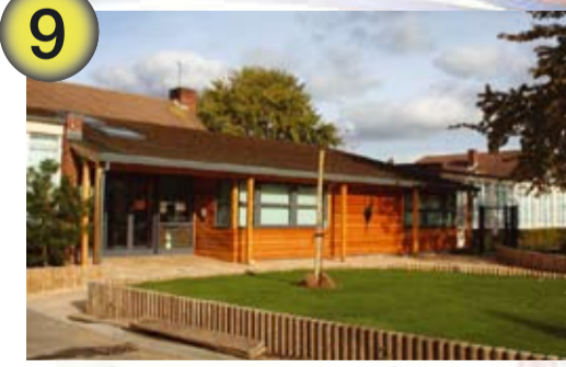
Court Lane Infant School