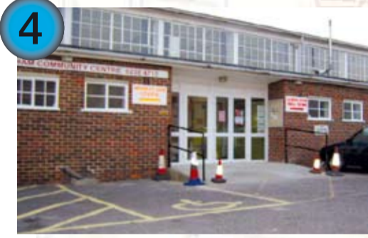
Cosham Community Centre