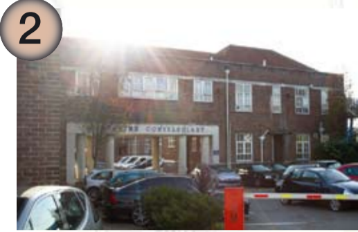
Cosham Police Station