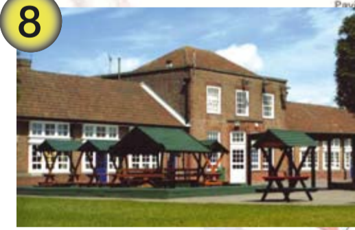
Court Lane Junior School