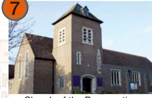
Church of the Resurrection