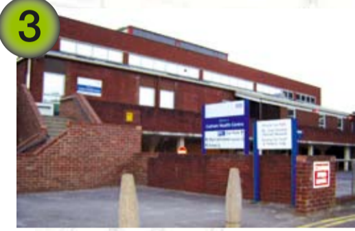
Cosham Health Centre