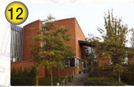
Solent Infant School