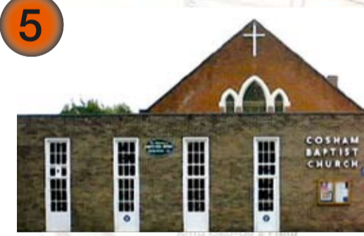
Cosham Baptist Church