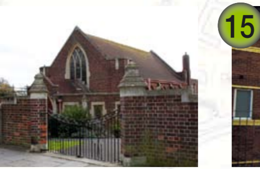
Drayton Methodist Church