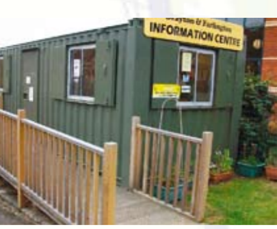
Drayton & Farlington Information Centre