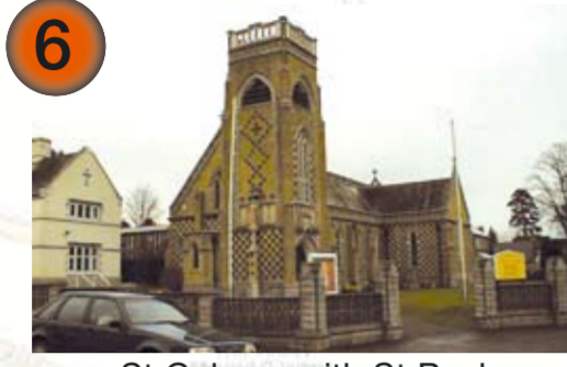
St Colman with St Paul