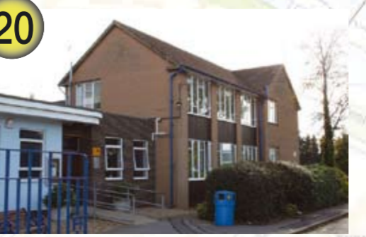
Redwood Park School