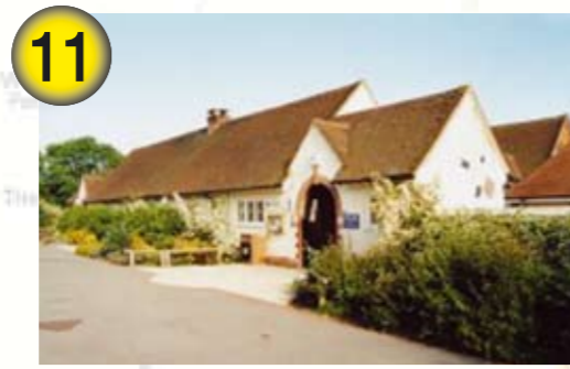
Solent Junior School