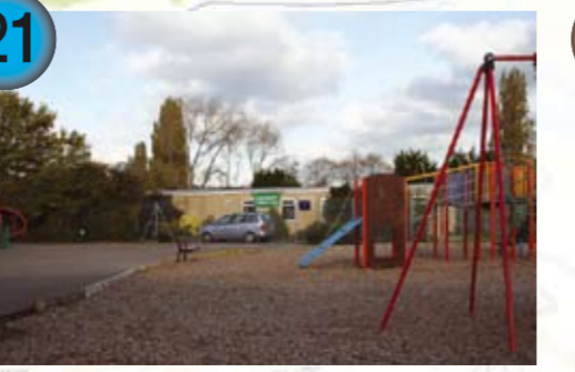
Highbury Community Centre